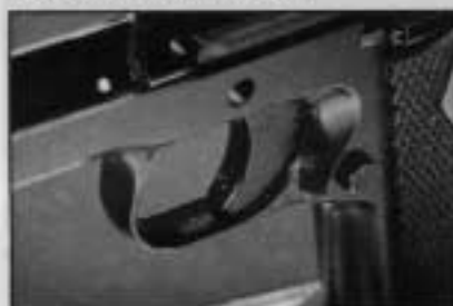
A long, solid trigger with overtravel screw allows a clean trigger break.

Company Inc. of Houston, Texas. This new firm then resumed the production of High Standard .22 target pistols and recently has expanded the High Standard line, by also manufacturing 1911 pistols, to include full size and compact models dubbed the Crusader (5-inch barrel) and Crusader Combat (4.25-inch barrel), respectively, as well as the Camp Perry National Match and the G-Man models. Finishes available include blued, parkerized, TDC (Thin, Dense Chrome) and Teflon.