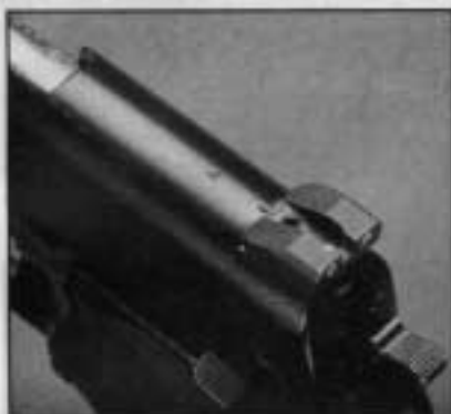
The G-Man 1911 has a nice combat sight with tritium inserts.