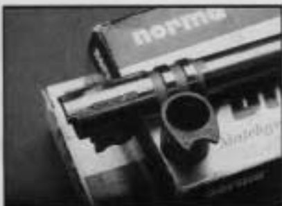
The G-Man 1911 uses a National Match barrel and bushing.