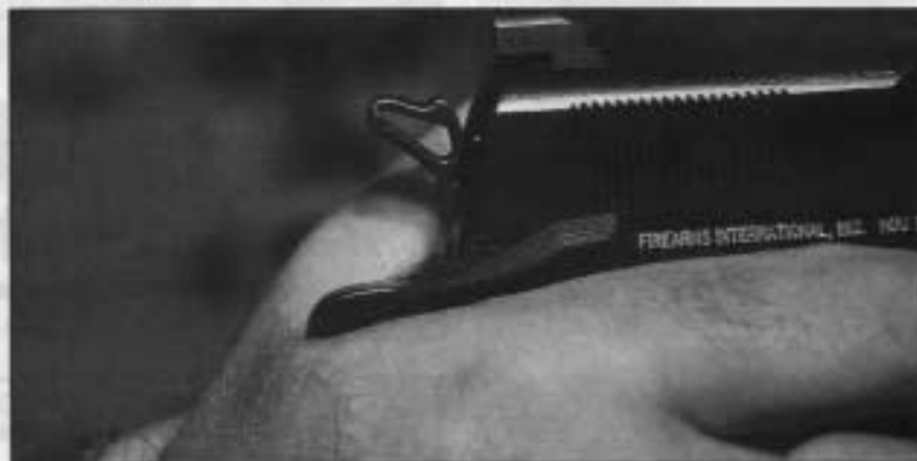
When ready to fire, the G-Man 1911 with the Safety Fast-Shooting kit installed has the hammer forward and the safety on.